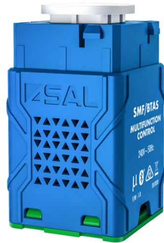
PIXIE Multifunction Controller #SMF/BTAS

Control any PIXIE device, groups or scenes from anywhere in the home when installed. Multifunction secondary devices which can be paired to operate with any Master PIXIE devices in either MIMC mode or SCENE mode. Comes with Bluetooth Mesh Technology.