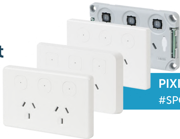
PIXIE Smart Power Point #SPO23/BTAM

A smart double power point (GPO) designed to operate as a standard 250V / 10A double wall socket and communicate with PIXIE devices via the centre mount Multifunction control. Interchangeable cover plates and caps available, child lock and power monitoring on board.