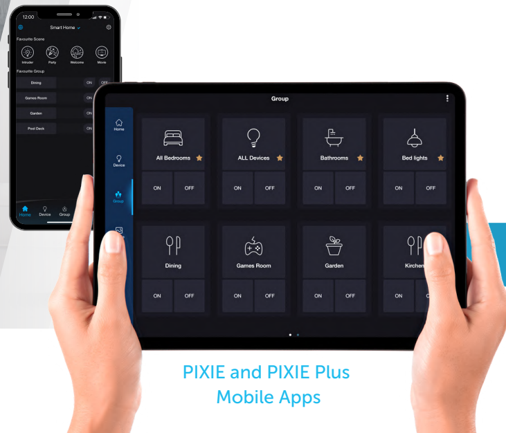
PIXIE and PIXIE Plus Mobile Apps