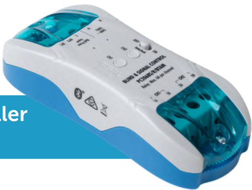
PIXIE Blind Controller #PC206BD/R/BTAM

A smart double power point (GPO) designed to operate as a standard 250V / 10A double wall socket and communicate with PIXIE devices via the centre mount Multifunction control. Interchangeable cover plates and caps available, child lock and power monitoring on board.