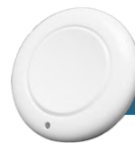
PIXIE Remote Control Button SMC/BT