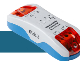
PIXIE Dual Relay Controller PC206DR/R/BTAM