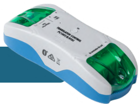
PIXIE Translator Control PC100T/R/BTAS