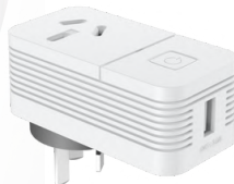
PIXIE Smart Socket ESS105/BT