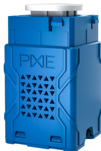
PIXIE Smart Dimmer G3 #SDD300/BTAM

PIXIE digital push button smart dimmer module for lighting control with wireless Bluetooth Mesh Technology. Comes with 24hour/7 Day scheduling, Groups, Scenes, adjustable fade rates and mobile app control & configuration.