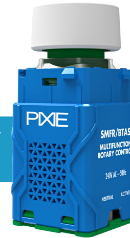
PIXIE Multifunction Rotary #SMFR/BTAS