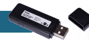
PIXIE Bluetooth Mesh Booster SGB/BT