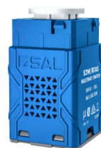
PIXIE Multiway Switch G3 S2W/BTAS